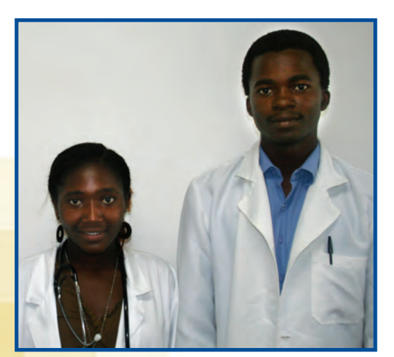
The bank funds the training of some Malawi College of Medicine students