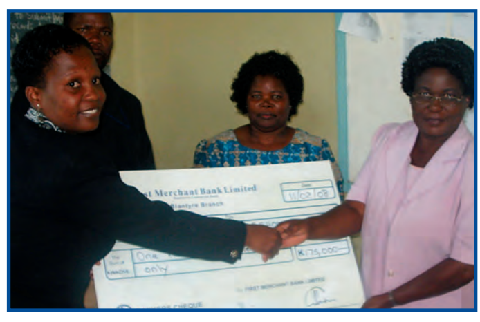
Support, in the form of tuition fees, at Chichiri Secondary School