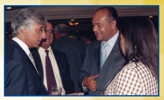
Guests at a customers' party at Mount Soche Hotel